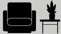
Chairs & Tables